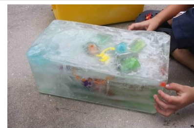
Ice Block Treasure Hunt

Yearly Education Fees are just around the corner. The $45.00 will be added to all preschool accounts on Sept 4. You are more than welcome to begin making payments.