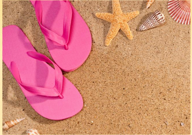
DO NOT Wear to School!!!