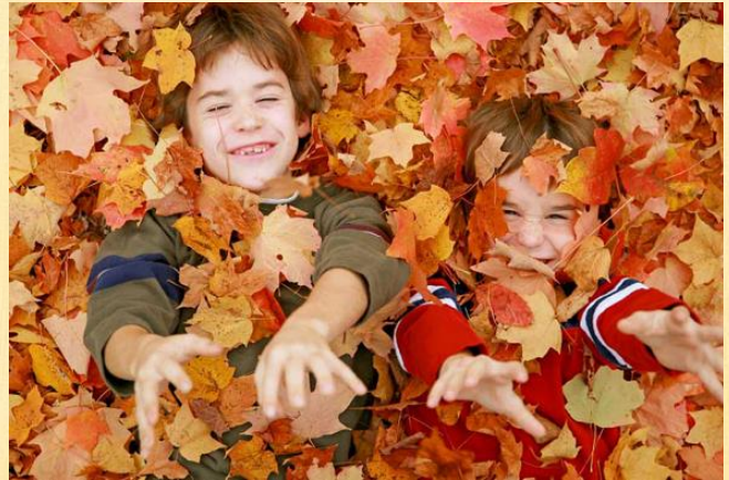
Fall is coming!!